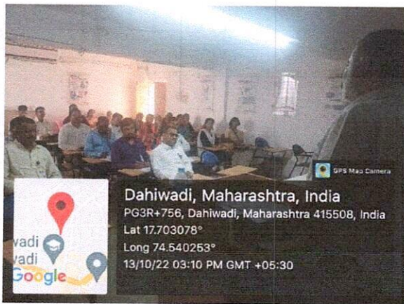
Guidance by Coordinator, IQAC