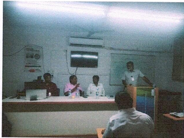
Discussion with the panel