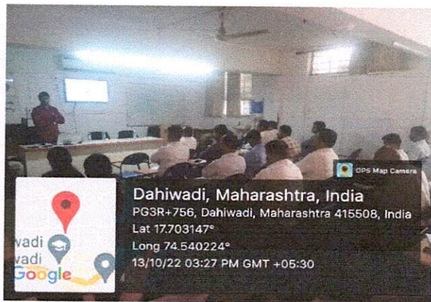
Discussion with the audience