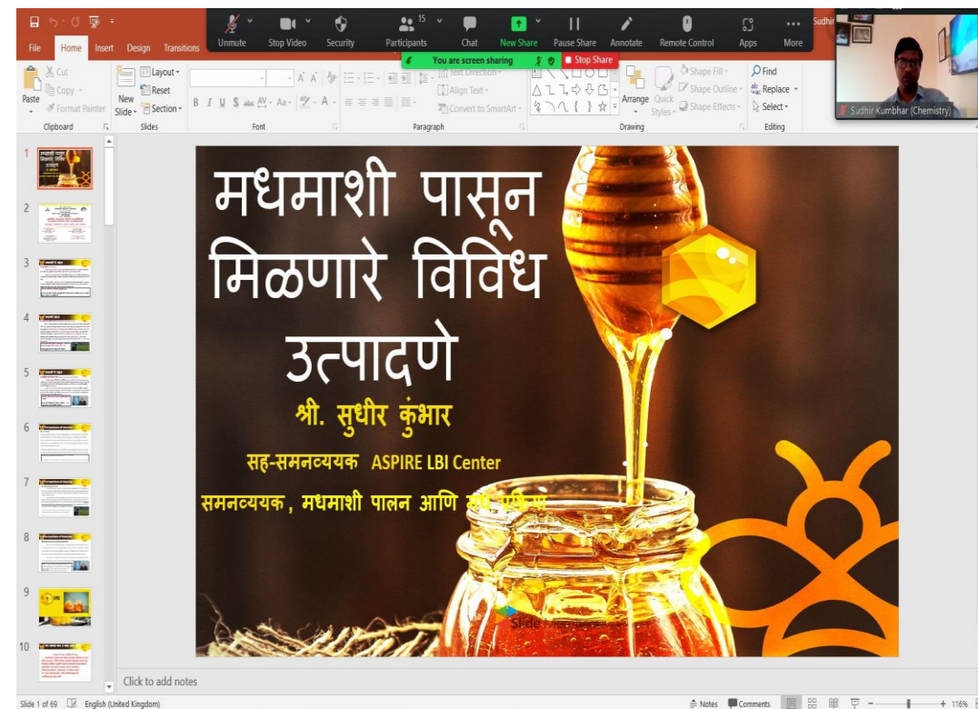
PPT of Training